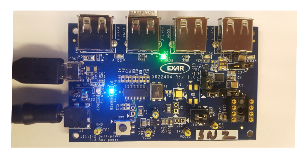
Figure 2: XR22404 PCB